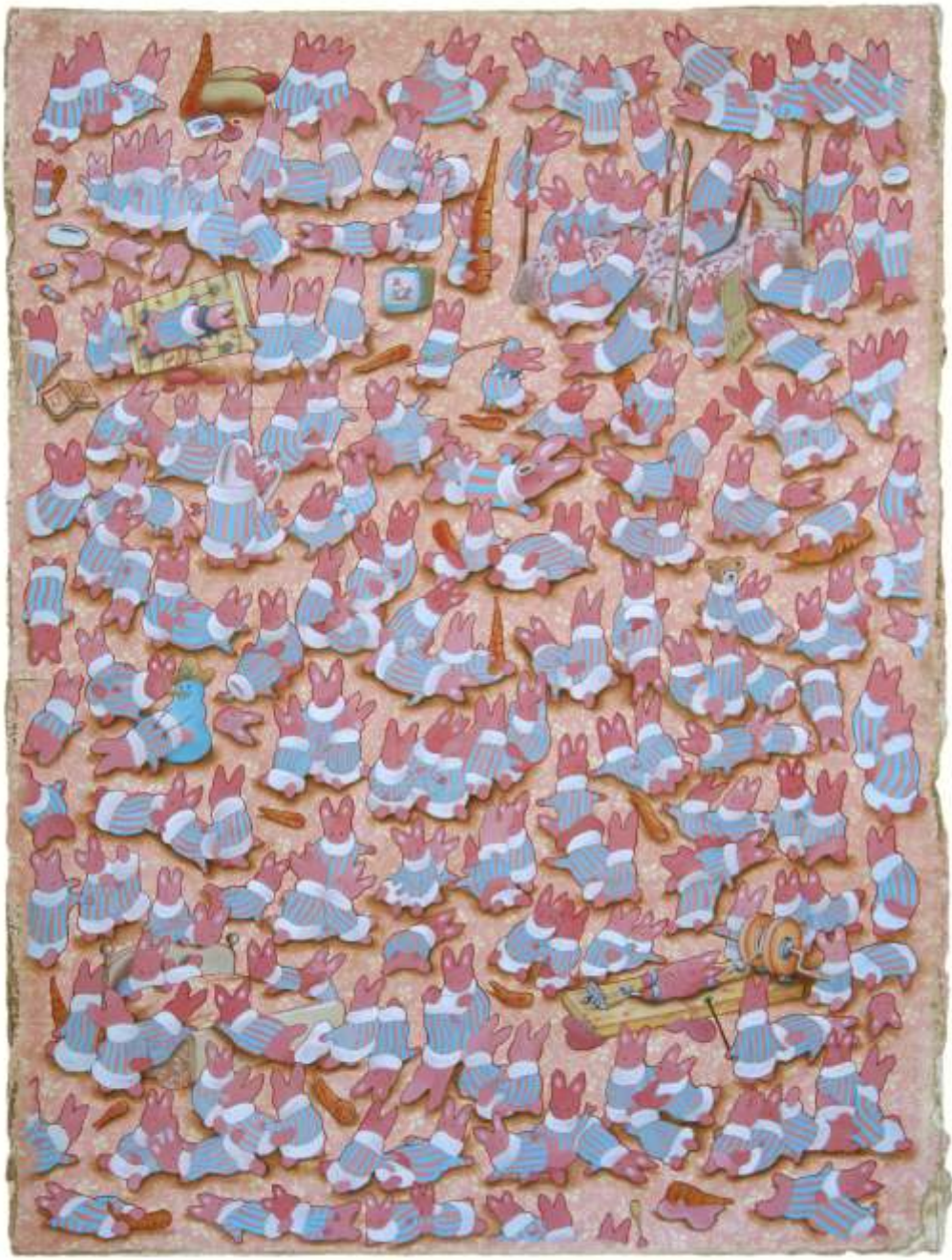
the shapes of things to come IV oil on wallpaper on paper, 30x22 inches, 2008