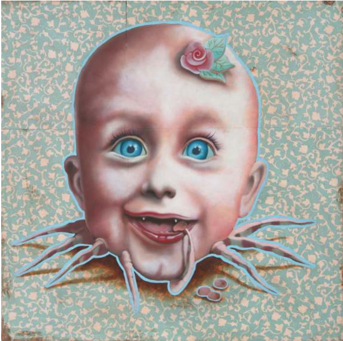
Vienna sausage monster oil on paper on panel, 20x20 inches, 2008