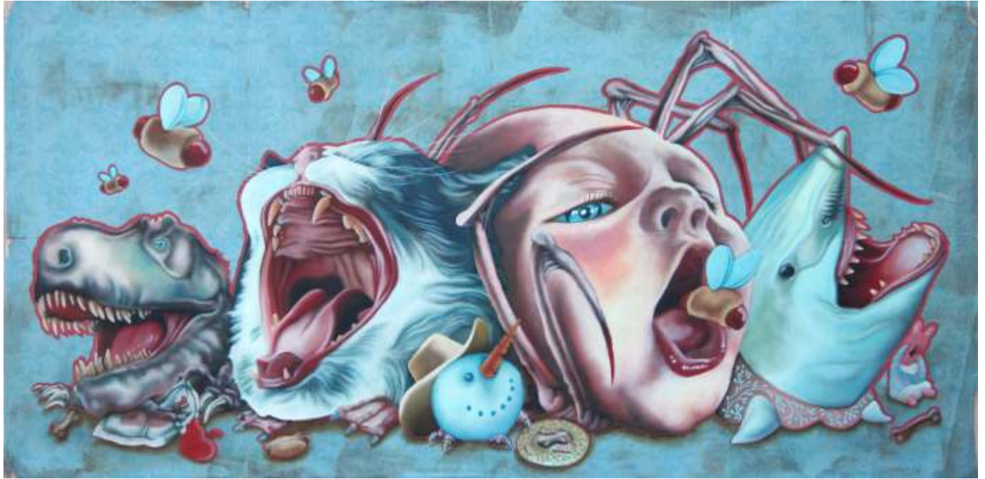
git 1 in ya oil on paper on panel, 24x48 inches, 2008