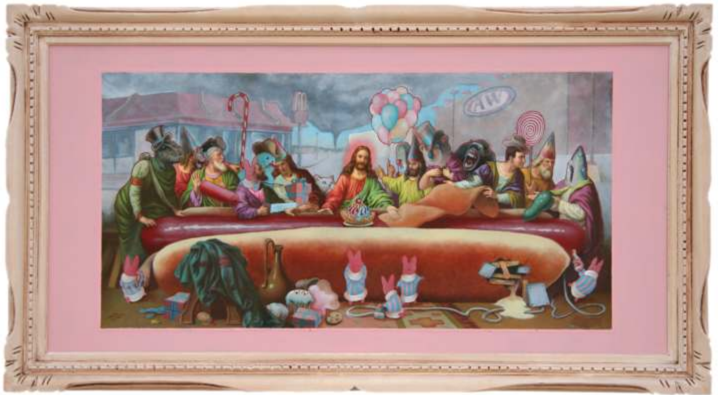
last supper II oil on print (framed), 24x48 inches, 2007