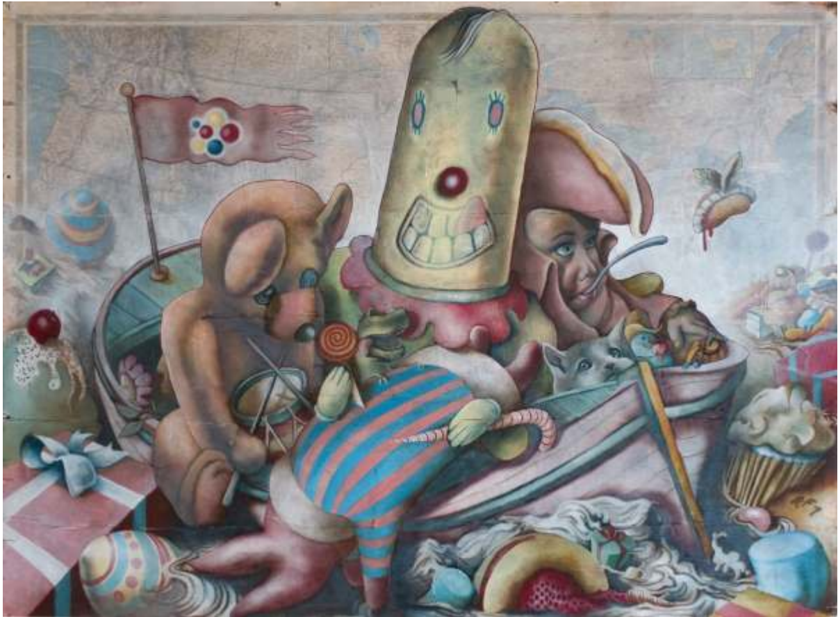
wonderland II oil on paper on panel, 36x48 inches, 2007