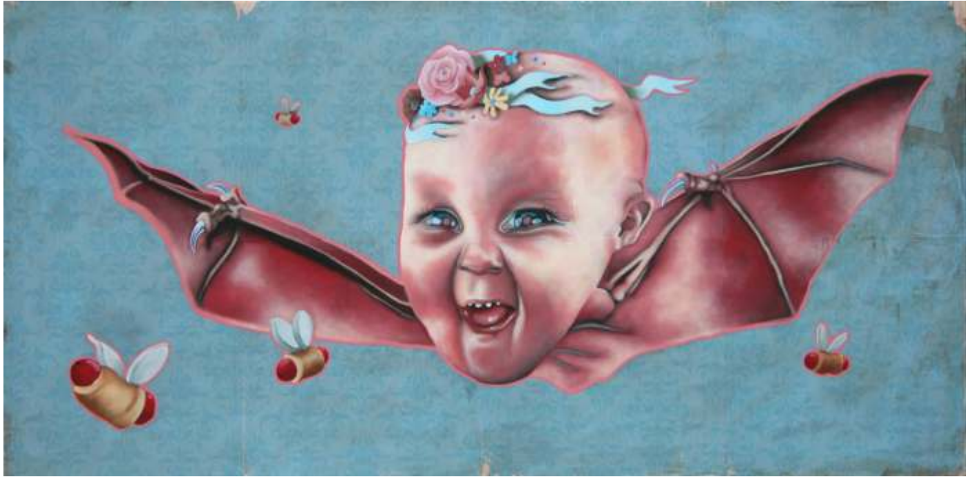
The dogcatcher oil on paper on panel, 24x48 inches, 2008