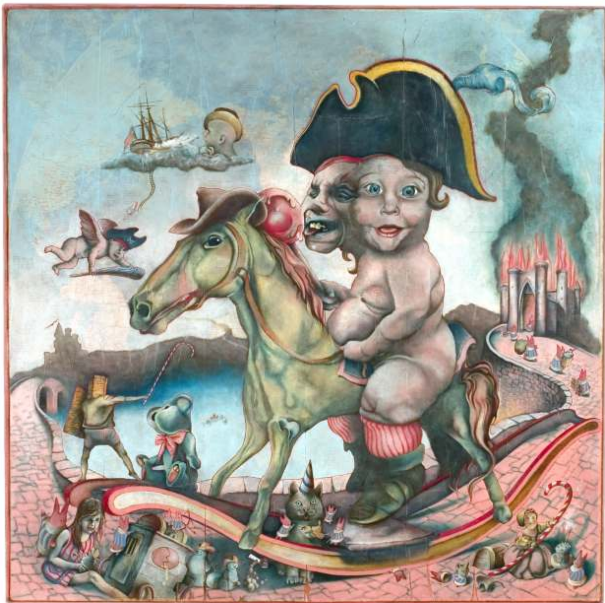
crackerjacker oil on paper on panel, 48x48 inches, 2006