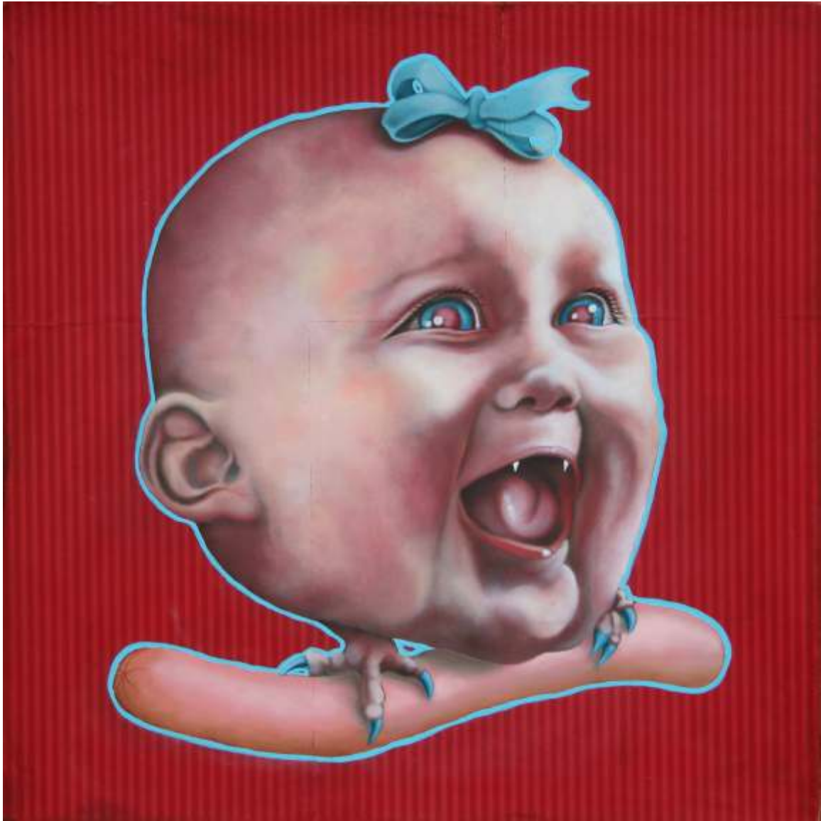
Frankenstein oil on paper on panel , 20x20 inches, 2008