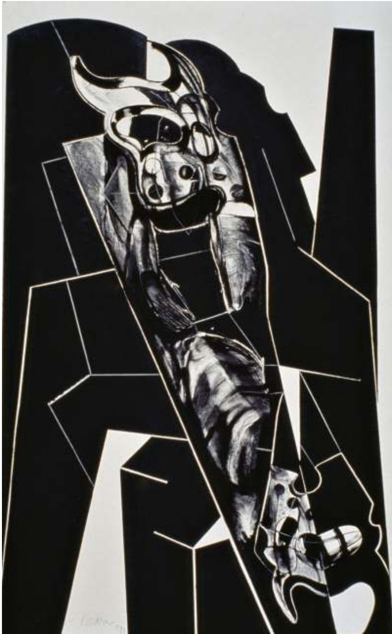
Constricted, Conflict Group - 77 x 50 inches - oil/charcoal on paper - 1991