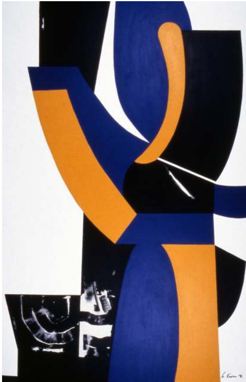
Blue Yellow Black #2 - 72 x 48 inches - acrylic on canvas - 1992