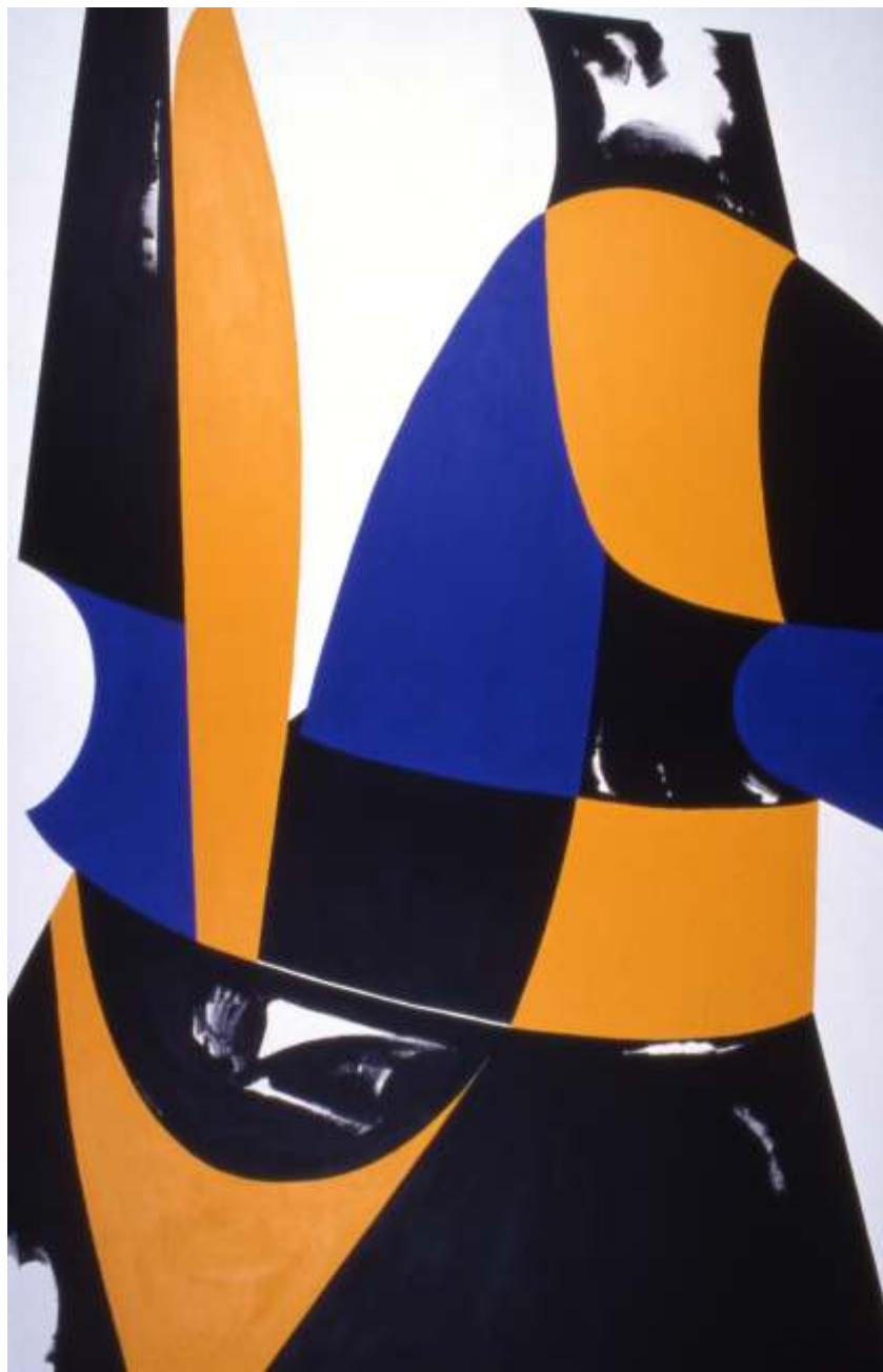
Blue Yellow Black #3 - 72 x 48 inches - acrylic on canvas - 1992