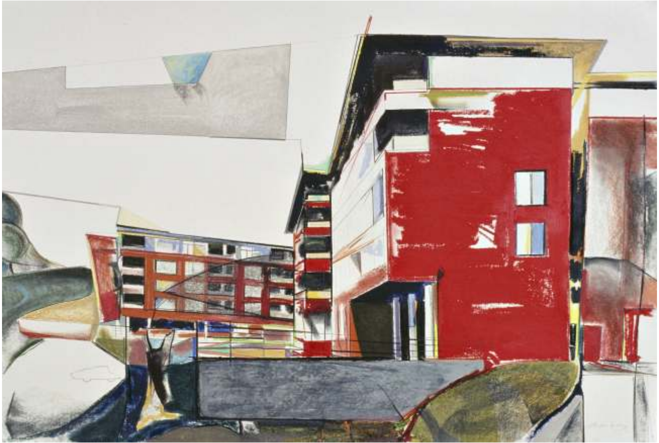
The Apartments - 38 x 44 inches - oil, pastel, charcoal on paper - 1992