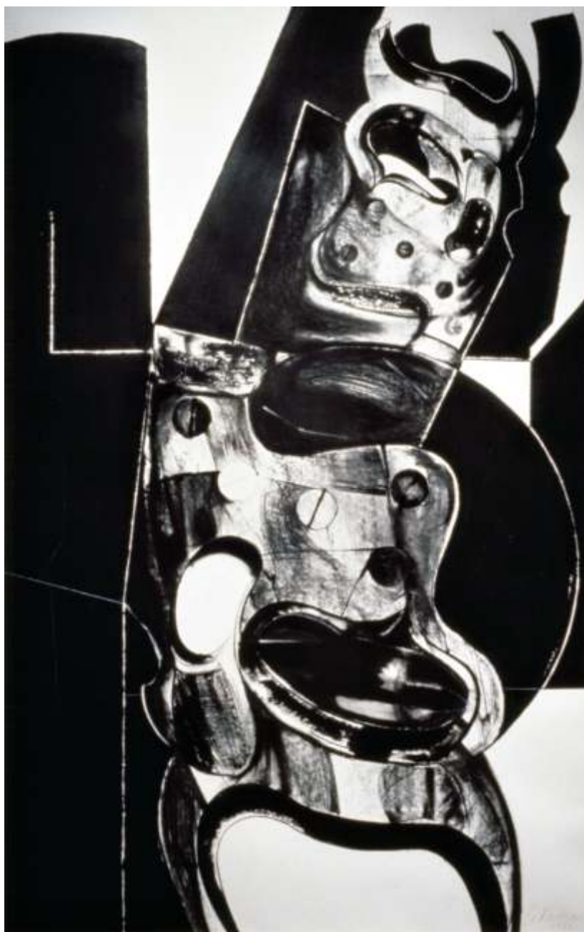
Capability, Conflict Group - 77 x 50 inches - oil/charcoal on paper - 1991