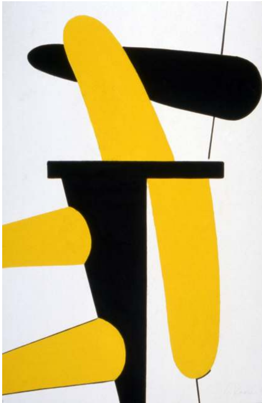
Yellow Black #2 - 54 x 38 inches - oil, graphite on paper - 1991