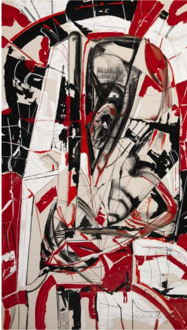
Repercussions - 77 x 44 inches - oil/charcoal on paper - 1992