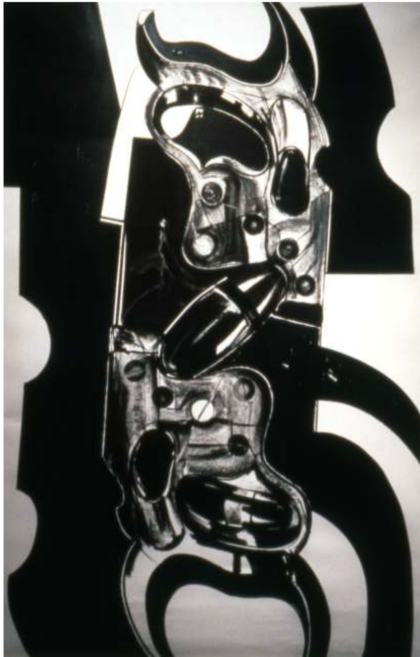
Mind Set, Conflict Group - 77 x 50 inches - oil/charcoal on paper - 1991