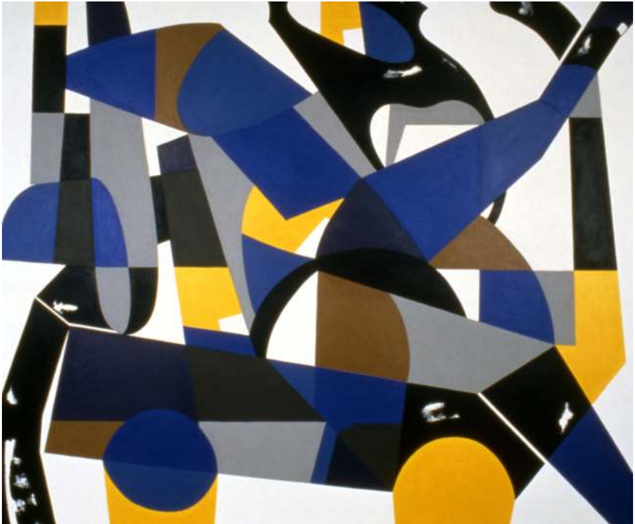
Horse and Rider - 68 x 72 inches - acrylic on canvas - 1992