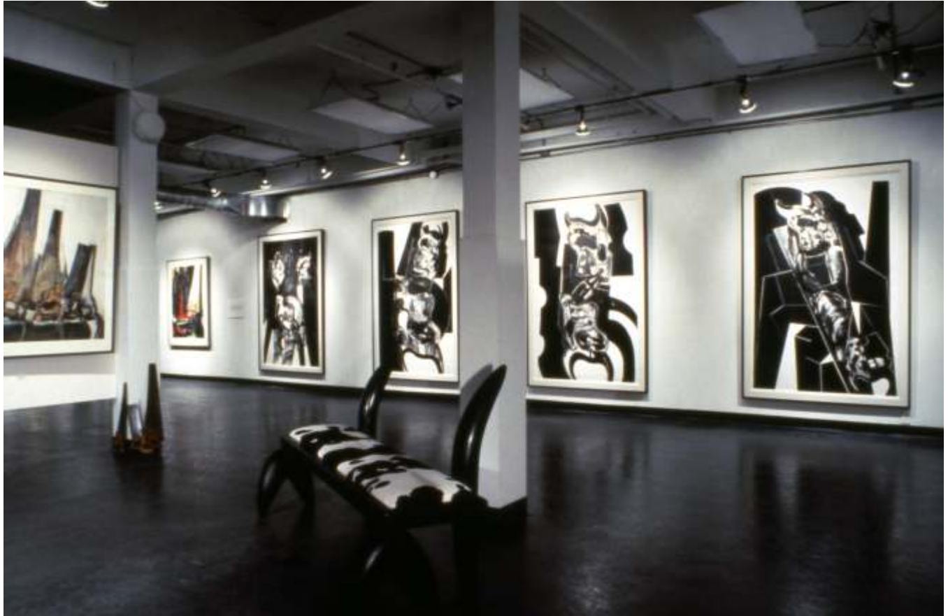
Installation photo, east wall, 675 King Street West, Toronto Kearns Willemse Exhibition, Independent and Non-Aligned, October 18-November 15, 1991 Photo by Elaine Kilburn, 1991, Toronto