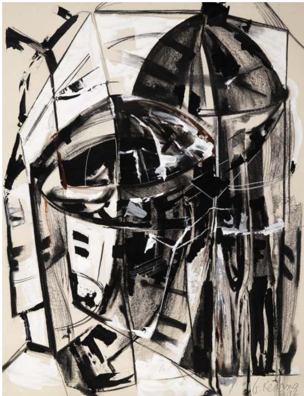
Constructions - 57 x 44 inches - acrylic, crayon, charcoal on paper - 1992