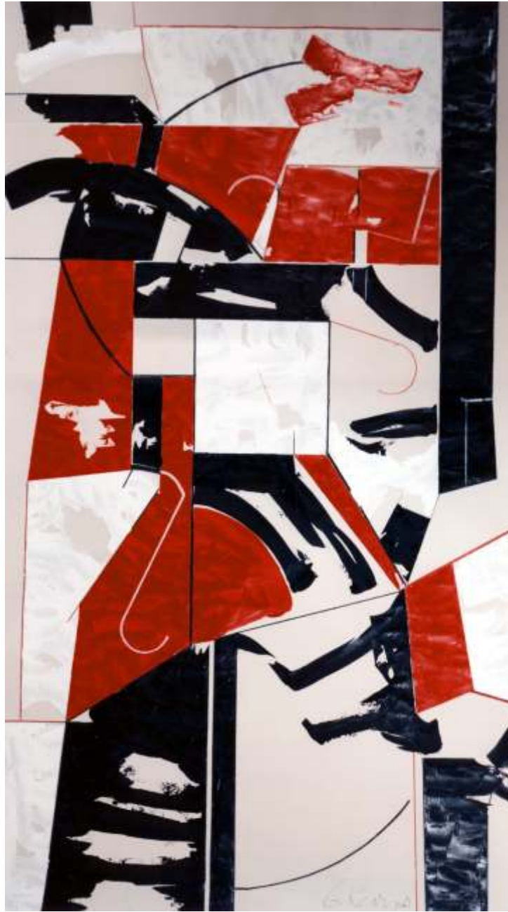
Red Black - 80 x 44 inches - acrylic, crayon, charcoal on paper - 1992