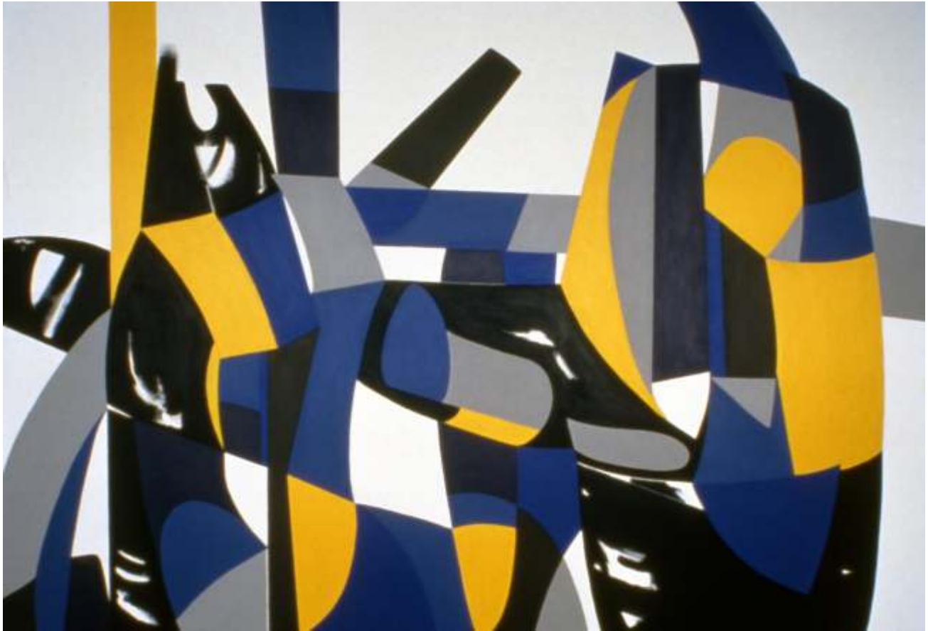
Containments - 72 x 96 inches - acrylic on canvas - 1992