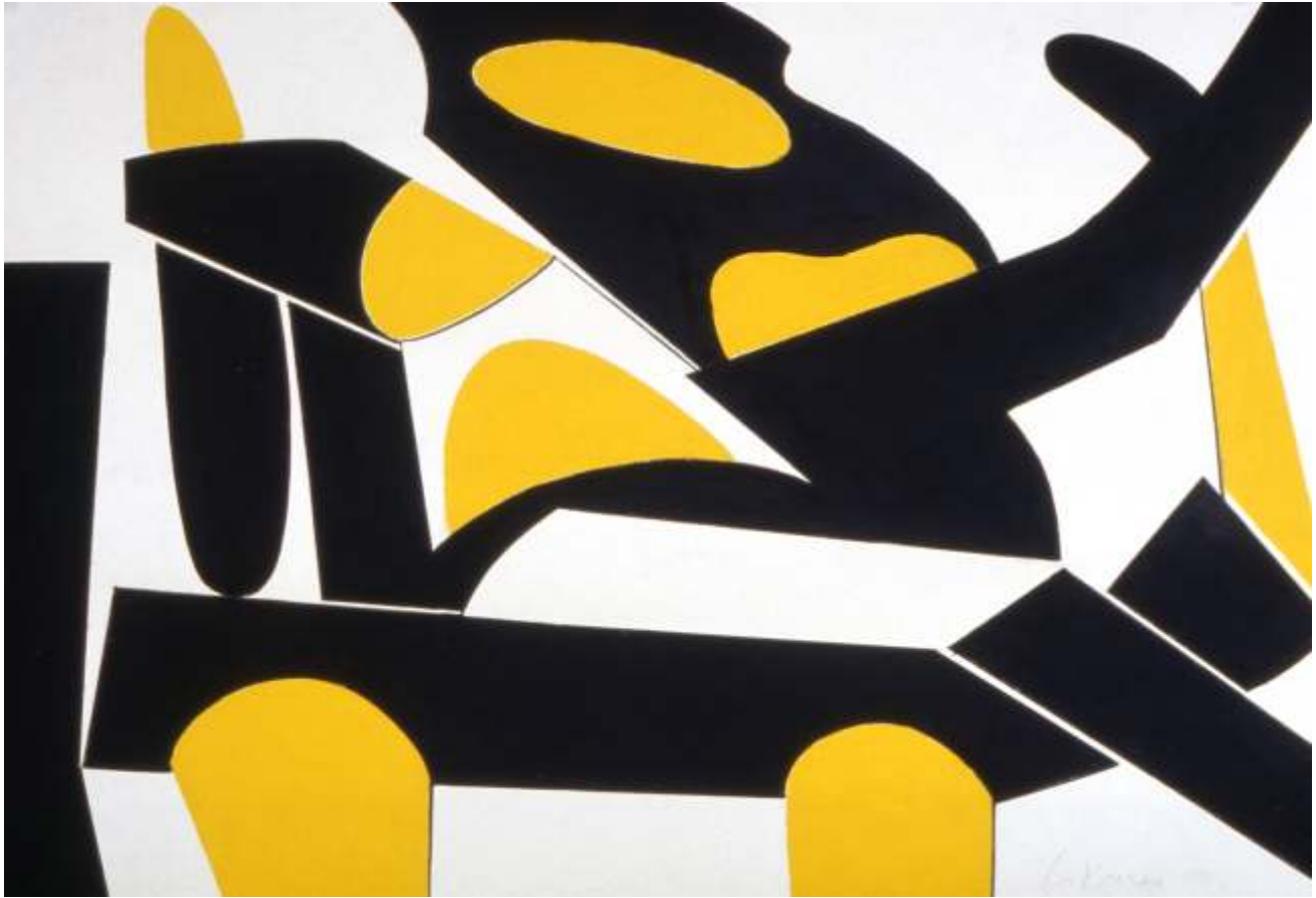
Yellow Black #1 - 38 x 44 inches - oil, graphite on paper - 1991