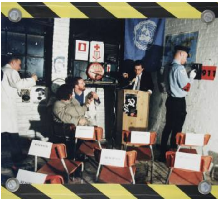
Free Speech For The Absent - photograph & mixed media, 20x25 inches, 1999