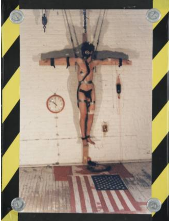
A Blessing & Sacrifice - photograph & mixed media, 16x20 inches, 1994